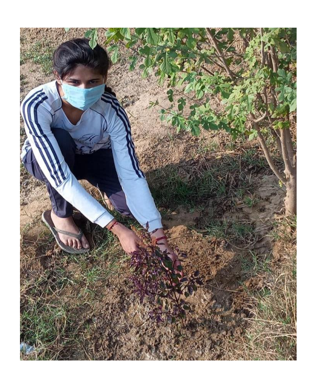
Cadet planting a sapling during tree plantation drive