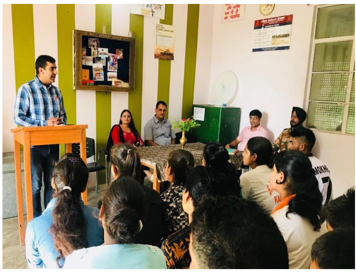
Talk programme organized by NCC Unit on 'Clean India'