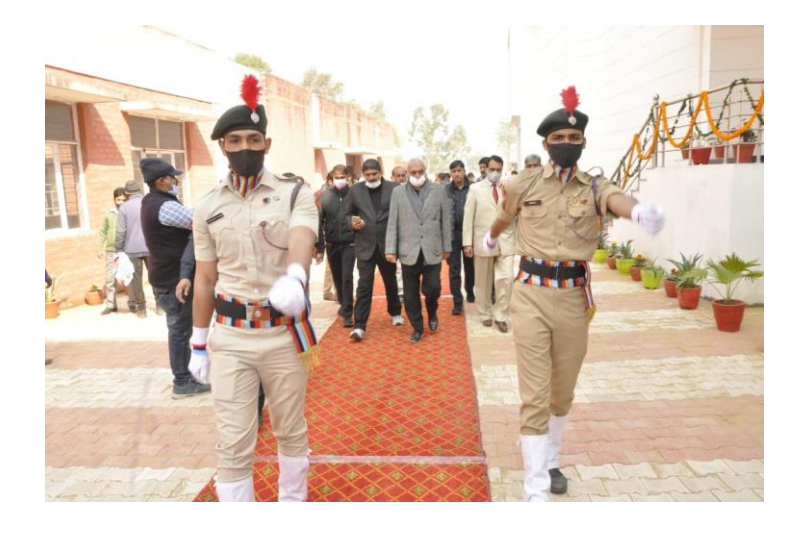
Piloting by cadets for Ex-Chief Minister of Haryana on the 50th Foundation Day of college