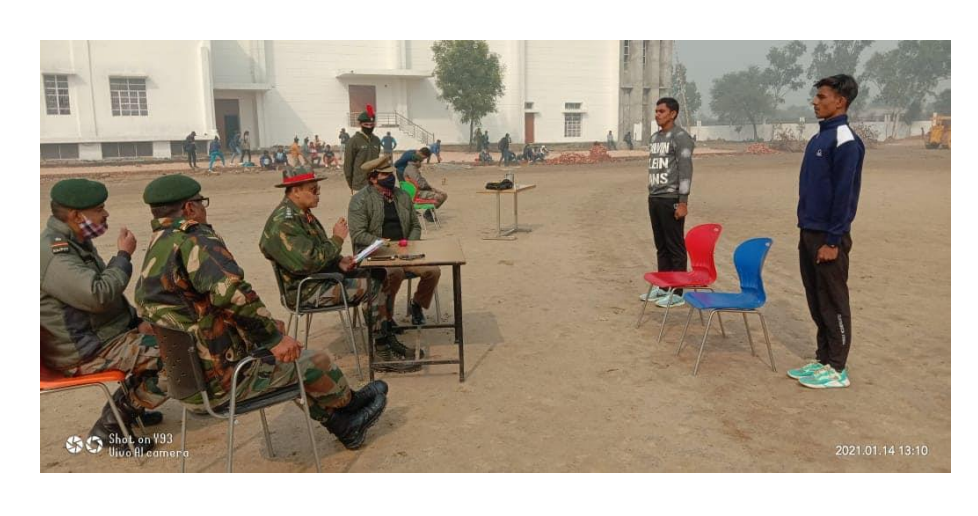
Personal Interview being conducted by Commanding Officer during enrollment process of NCC Unit