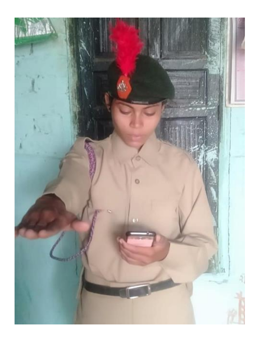
Cadet reading preamble on Constitution Day